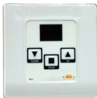
Electronic Screen Control