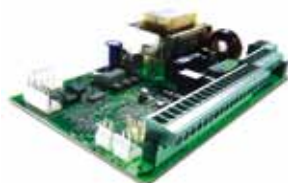
Built-in control board 624 BLD Technical specifications page 158