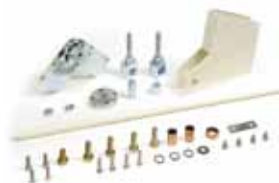
Articulation kit - max. ceiling height 3 m (only for standard rectangular beams)