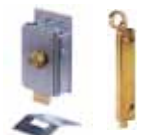
Various accessories page 194